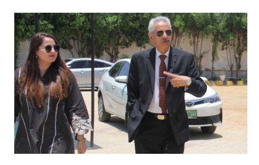
ILMA University's new Library was inaugurated, emphasizing its importance as a hub for intellectual growth and innovation. The facility offers a conducive environment for knowledge expansion, research, and a love for learning. The event marked a significant milestone in ILMA University's academic journey.